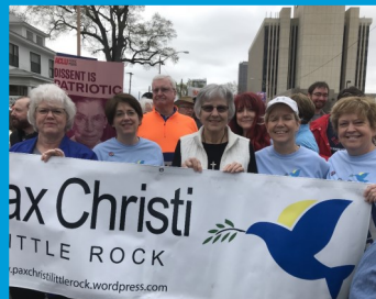
PCLR Attends March for Our Lives

Pax Christi Little Rock members walked in solidarity with youth across the country at the "March for Our Lives" rally at the Arkansas State Capitol in Little Rock. Hundreds gathered on Saturday, March 24 to demand new gun control laws following the shooting in Parkland, Florida that killed 17 high school students and staff. The march in Little Rock was one of more than 800 held worldwide. Several young people along with