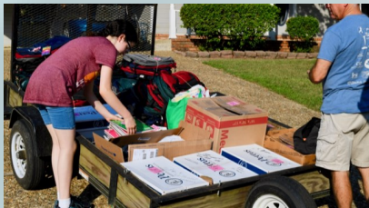
Taking Supplies to CTK

plies. It's fair to say that the party is bigger and better than ever this year. When PCLR started this project back in 2017, we worked with Rock-