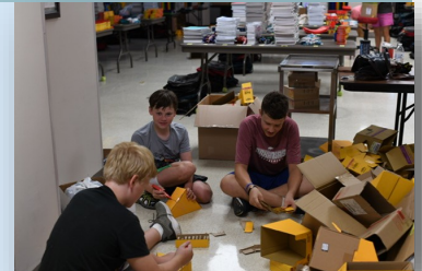
Scouts Break Down Boxes

None of this would have been possible this year without the help of many donors who contributed over $12,000 (often $10-20 at a time) to provide all of these backpacks. Many friends of Pax Christi came through in significant ways. Christ the