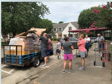
Lots of Help Unloading

Some one mentioned that, if we keep growing, next year we might think about renting out Verizon Arena! Of course, it is a beautiful thing to be able to help so many school children get their year off to a good start. However, there are many more blessings provided by this endeavor. Each year, more and more people get involved and help make this dream a reality.