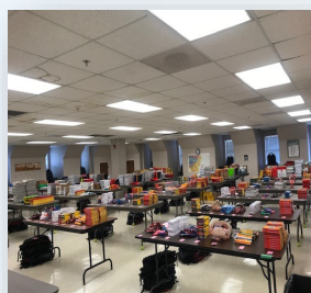
Calm Before the Storm

made sure we got paperwork to apply for tax free status as a non-profit all year round. PCLR has a new peace partner! So, the stage is set and the party will start Monday, Aug 5 (6 pm) at CTK.