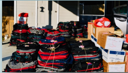
Piles of Backpacks and Supplies

For the third year in a row, Pax Christi Little Rock is preparing to throw a party to pack backpacks full of school sup-