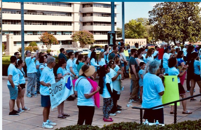
END FAMILY SEPARATION RALLY

On July 27, Pax Christi Little Rock members attended the End Family Separation Rally at the State Capitol. Several DACA students and immigrants spoke about the untenable situation at the US-Mexico border, protesting the current treatment of immigrant families and the forced separation of children from their families.