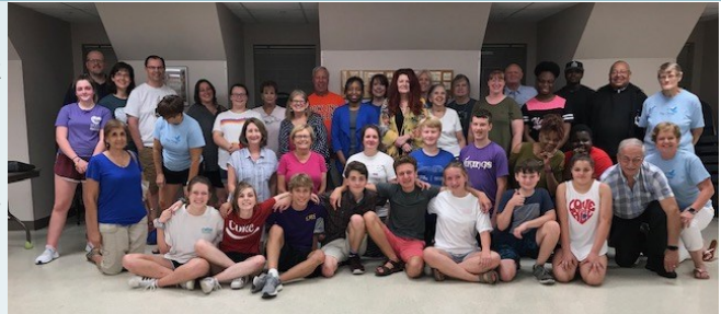
Back Pack Crew