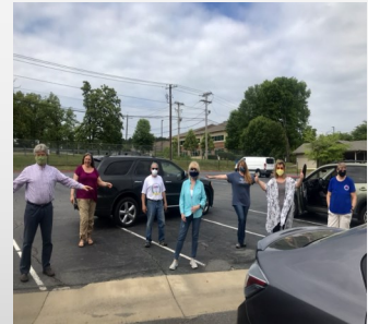
PCLR Food Collection

us, and his ways are definitely not our ways. I'm beginning to understand that bigger is definitely not better and that the gift of Pax Christi occurs when there is a personal, intimate connection between two or more people. In addition to just being in the same room at the same time, I think both people must be drawn to the present moment together, either by great love or great pain. They must actually see one another, look into one another's eyes. It is when this happens that we know we are in the right place at the right time, ready to give it all away, standing in the light with our brothers and sisters.