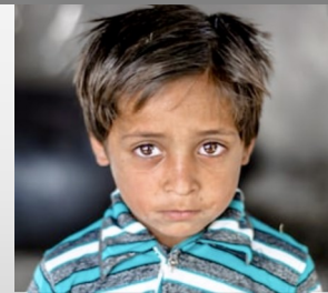
In search of peace

I know many of us have switched from rushing around trying to get it all done in our daily lives to taking moments to draw closer to others or just take some quiet time. This has been a vital reminder of how Christ modeled giving peace to others, often one person at a time. I’ve been hearing so many stories of people taking the time to talk with an aging parent or actually spending time doing things with their spouse and children. It seems that when we slow down enough, we might just fall into that present moment where Christ, and the peace He brings, resides.