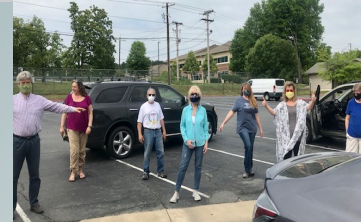
PCLR members donate

If you are interested in becoming a part of this project, please email PCLR at paxchristilr@gmail.com with your intention. Pax Christi plans to continue contributing to this family for several weeks to come and would appreciate your involvement!