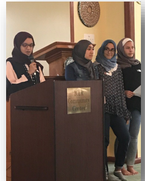
Islamic Youth Group