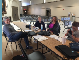
Blessing Bag Committee