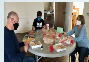
The Three Musketeers

In November, using the list of people Settled Souls helped in 2020, the committee contacted over forty people to ask them if they would like food for Thanksgiving. Food was purchased with Pax Christi funds, and