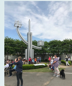
Peace and Hope