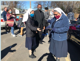
Sisters Join in