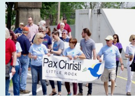
Pax Christi shows up -

over the Junction Bridge to the Beacon for Peace and Hope. Once everyone arrives, there will be an Interfaith Remembrance Service that is centered around reading