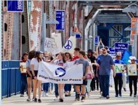
Junction Bridge 2019

The Pilgrimage for Peace is an annual event that has involved a coalition of over 30 interfaith and community groups in Arkansas in years past. The purpose of this event is to “mourn the violence committed in our community and in the world and walk together as active peacemakers.” Unfortunately, the Pilgrimage had to be cancelled last year due to COVID-19 restrictions. In 2021, however, Pax Christi Little Rock has agreed to organize the Pilgrimage and the Remembrance Ceremony following the walk, keeping all COVID guidelines in place including requiring masks and distancing at all times.