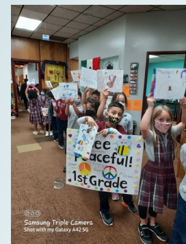
St. Theresa's Peace