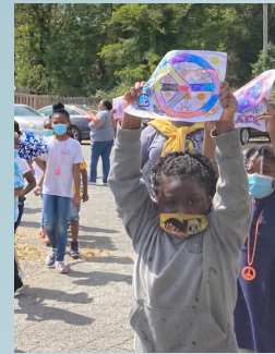
Kids for Peace