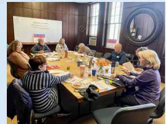
PCLR Synod Forum

It was an amazing two days in which people shared intimate details of their lives within the Church. One of the members of Pax Christi shared his person-