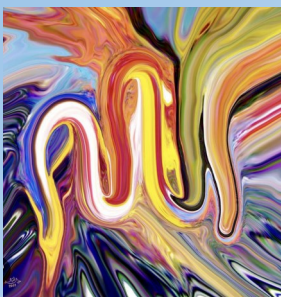
Abstract of God's Name

Each name carries a story that the story itself is not complete without. A name invites us to meet all aspects of the person and not just the most voiced parts or the comfortable parts. A name allows us to relate to the person's life, family, pain, and their aspirations.