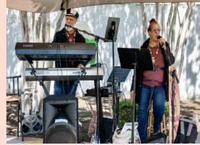
Fire and Brimstone