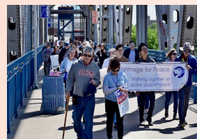
Crossing the Bridge

around the theme of peace interspersed with reading the names of all who died at the hand of violence in Pulaski County in the past year. A chime was struck after the reading of each set