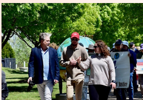
Telling the Stories

this perfect spring day to walk about a mile down President Clinton Avenue, through the River Market, and across the Junction Bridge to the Beacon for Peace and Hope in North Little Rock.